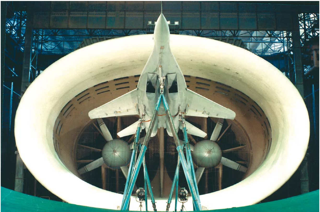
Mig 29 T-101 mock-up in course of aerodynamic tests in the wind tunnel of TsAGI.