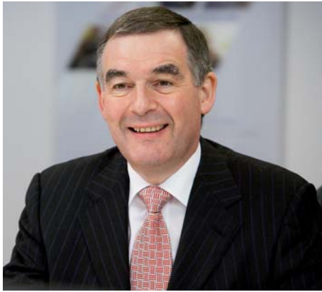
Allan Cook is President of the ASD and CEO of Cobham.

“ Good morning Ladies and Gentlemen and a very warm welcome to the annual ASD press conference, during which I will touch upon important developments that are currently affecting the European aerospace and defence industries which will include our collective view of the current global economic and political situation. I will also address key policy issues and I will present data compiled by ASD on the performance of the European aeronautics, space and defence sectors in 2008, in terms of orders, employment, and turnover.